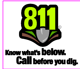
Exhibit B 1 of 1