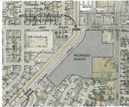
MIDLAND DRIVE SIDEWALK PROJECT AREA VICINITY MAP