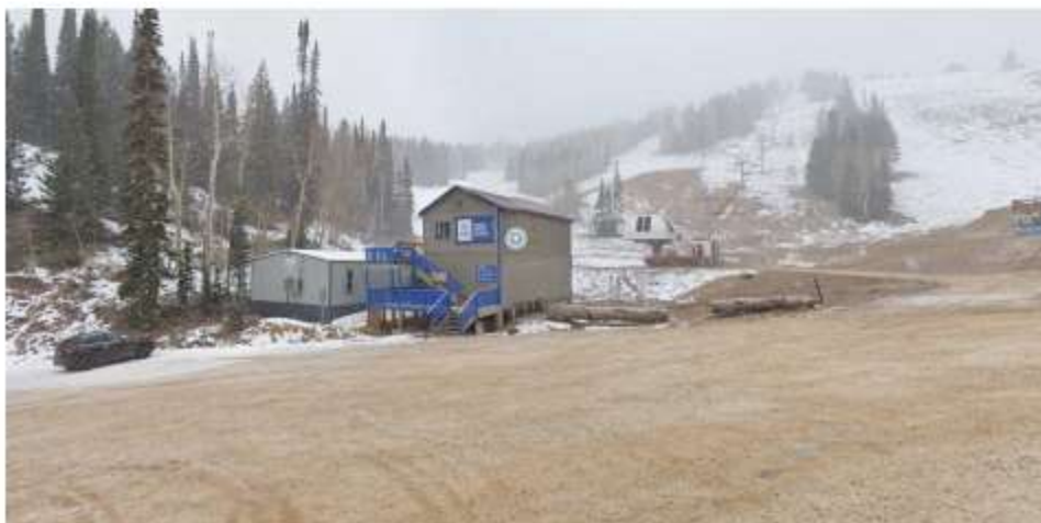
Picture above: existing ski school building to be demolished, adjacent trailers to be removed

The existing ski school building is outdated and undersized. This building will be demolished and removed. There is a double wide mobile trailer adjacent to the existing ski school building that will be removed from the site.