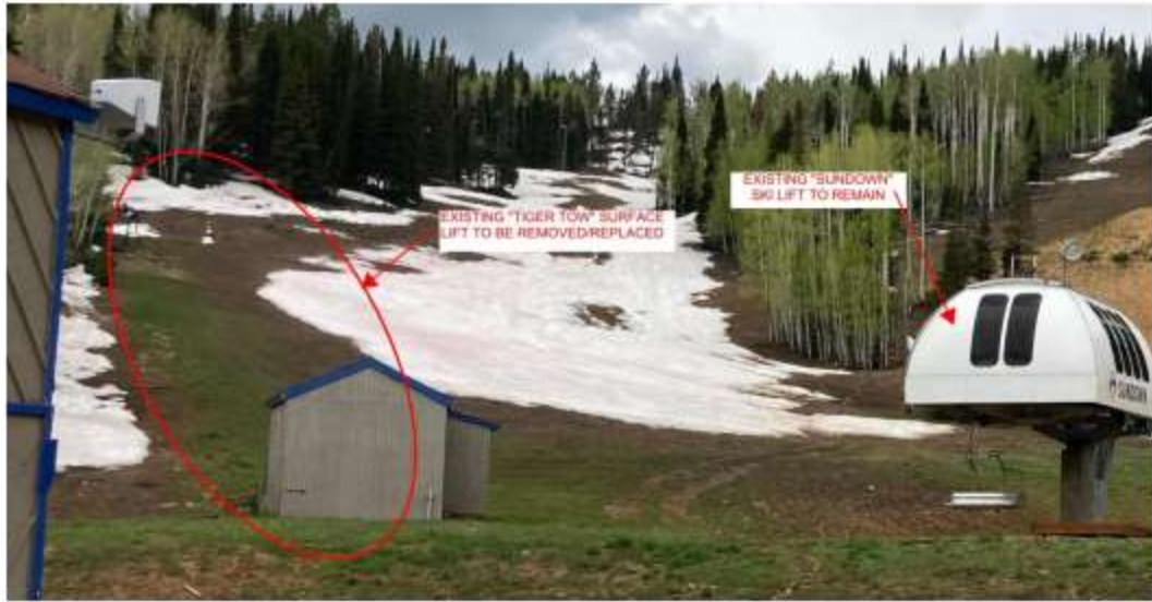
Picture above: existing Tiger Tow surface lift to be removed/replaced