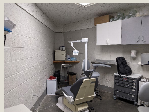
Current dental room