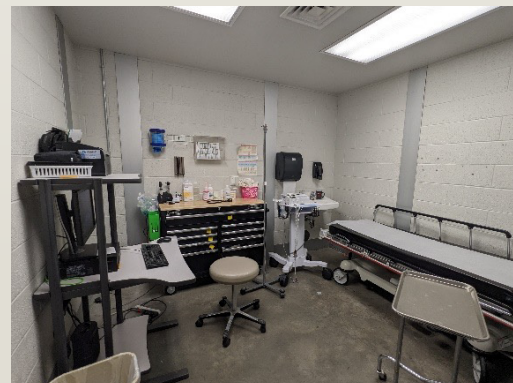
Current medical room