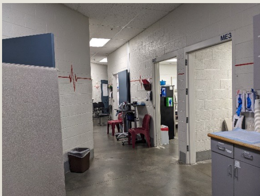
Current medical & mental health facility