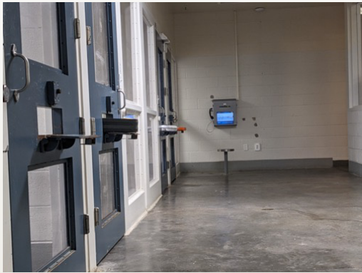
Current male medical cells

The new facility will have 48 additional mental health beds for inmates with mental health issues.