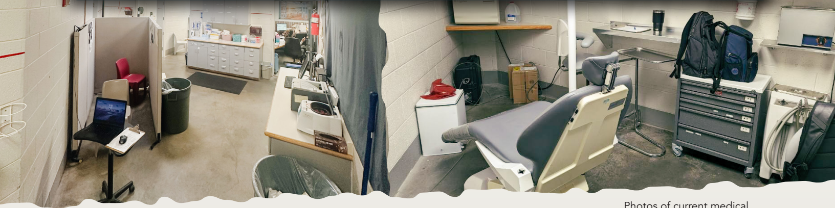
Photos of current medical and mental health facilities.